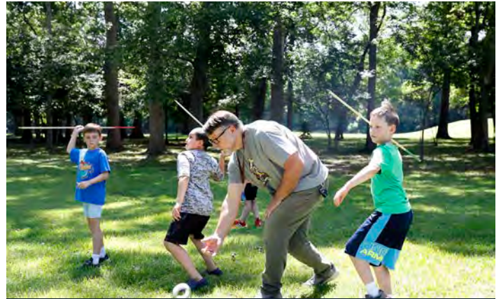
Campers play a game of chunky during Discovery Week Summer Camp at the Grand Village of the Natchez Indians.