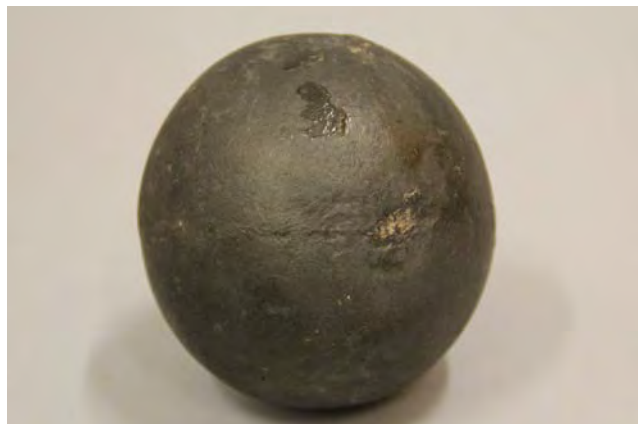
Six-pound iron shot recovered from Champion Hill Battlefield.