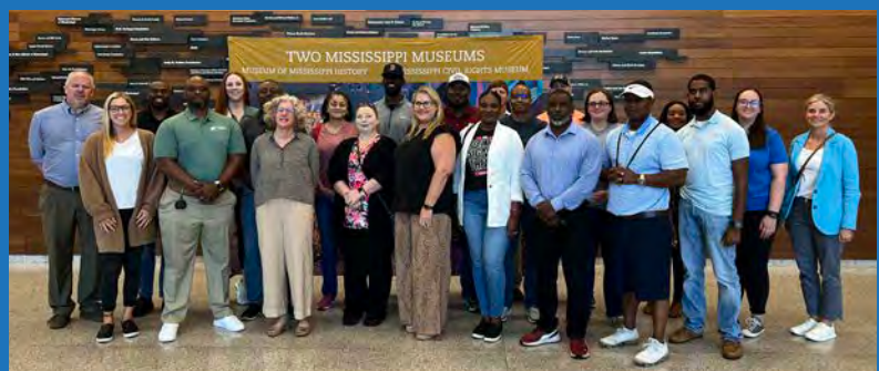
On the Friday before the Juneteenth Weekend started, a group of Ingalls employees visited the Two Mississippi Museums.