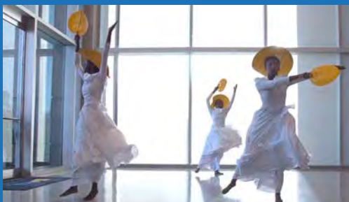
Dancers from Judah School of Performing Arts.