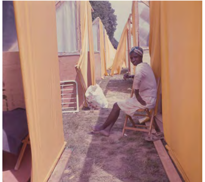
Woman between tents, Resurrection City, Washington, DC, 1968.

1968. The rally at the Lincoln Memorial featured speeches by Coretta Scott King and Rev. Ralph Abernathy as a continuation of the 1963 March on Washington for Jobs and Freedom.