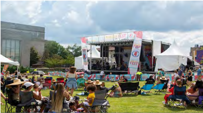
Visitors enjoy live music, food, and shopping during Mississippi Makers Fest at the Two Mississippi Museums.