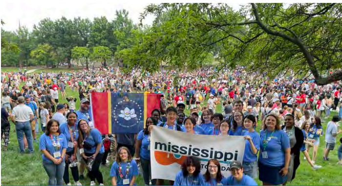
Mississippi students compete in the National History Day contest held in Washington, DC.