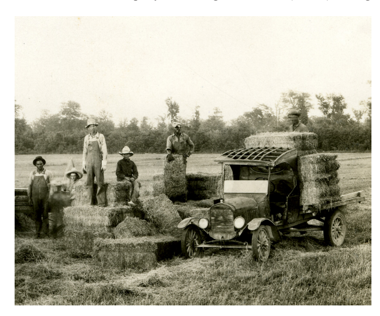
Detail from "Alfalfa," male workers in alfalfa field, 1929.

copies of newspaper and magazine articles generated by the Student Nonviolent Coordinating Committee (SNCC) during